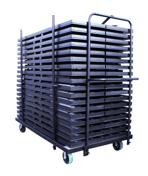
RT Reveal High Capacity Cart