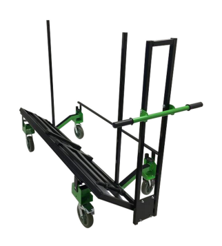
XpressPort Linenless Slant XpressPort Space Saver Stack Cart