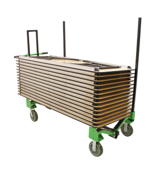
XpressPort Slant Stack Cart