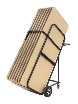
RT Cart – Upright